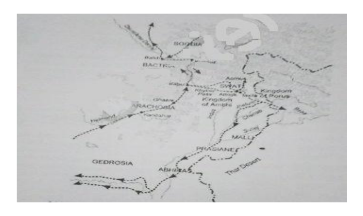
MAP 1.6 The Persian Empire